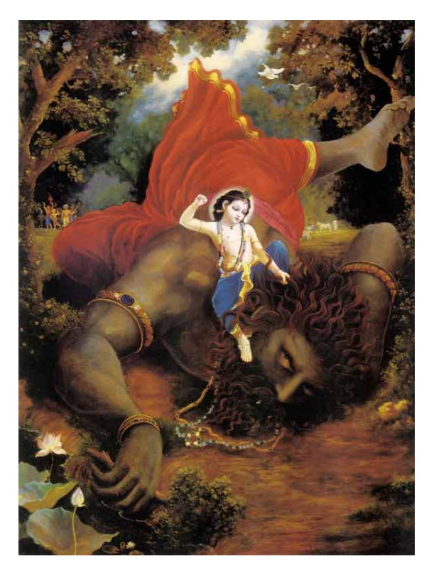
Lord Balarama killing the Demon Pralamba

[[She says, "I am growing pallid, my mind is confused and I have no sense of shame. My mouth is becoming pale, I don't want to eat or sleep and I am growing thin. If the god colored like the roaring ocean puts on me his cool thulasi garland, all these problems will go away. Take me to the banyan tree where Balarama conquered the Asuran Pilamban and leave me there.".]]